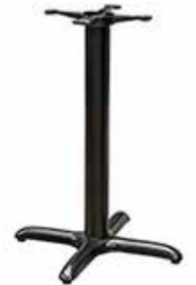
4 VANE TABLE BASE