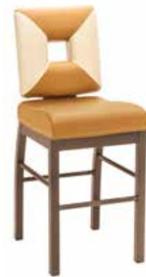
PAV-102-B Window Back