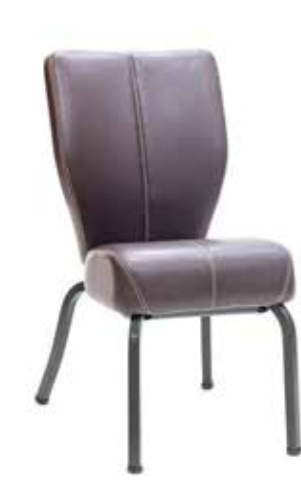
NPT-100 Shown with Optional Accent Stitching

FEATURED MODEL: NPT-100 Shown with Optional Accent Stitching