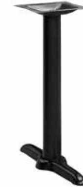
2 VANE TABLE BASE