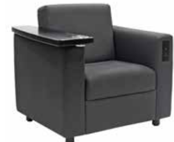
MET-100 with optional tray