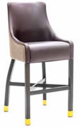
CNL-100-M-B Shown with Optional Aluminum Base