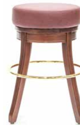
BWS-100 Shown with Optional Brass Plated Footrest

FEATURED MODEL: BWS-100 Shown with Optional Brass Plated Footrest