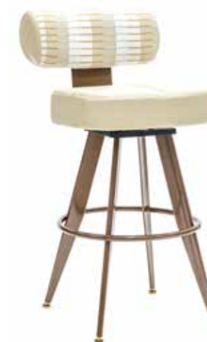
GIB-100-B Barrel Back