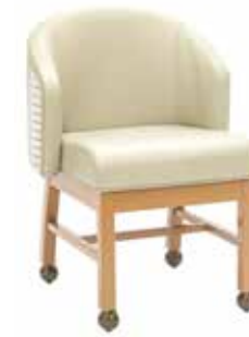
PAV-114-C Wraparound Back Shown with Optional Head-to-Head Tacking and Metal Ball Casters