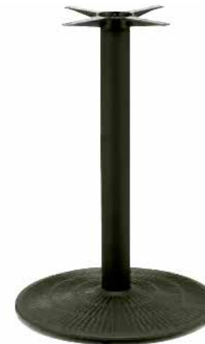
ROUND BAR HEIGHT TABLE BASE