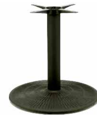
ROUND TABLE BASE