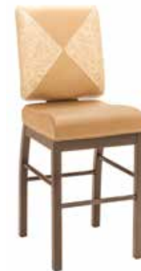
PAV-100-B Square Back