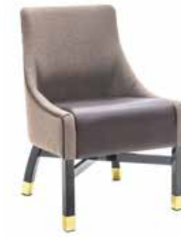
CNL-100-M Shown with Optional Aluminum Base