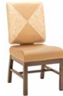
PAV-100 Square Back

FEATURED MODEL: PAV-114-B Shown with Optional Head-to-Head Tacking