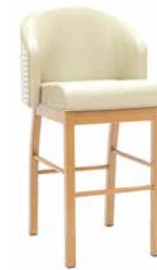
PAV-114-B Wraparound Back Shown with Optional Head-to-Head Tacking