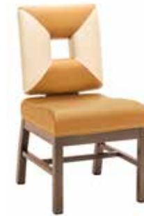
PAV-102 Window Back