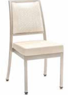
GTW-103 Shown with Optional Integrated Handle