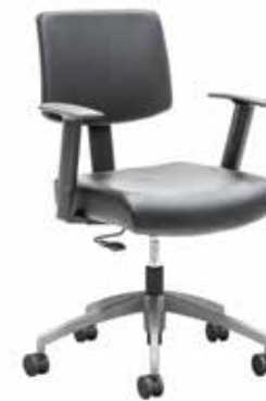
GEN-100 Shown with Optional Adjustable Poly Arms