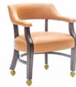
LNT-100 Shown with Optional Metal Ball Casters