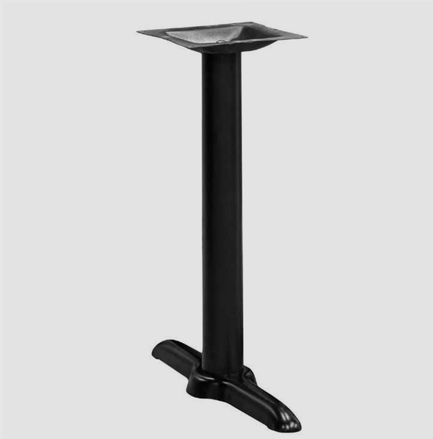
2 VANE TABLE END BASE (2 BASES REQUIRED PER TABLE TOP)