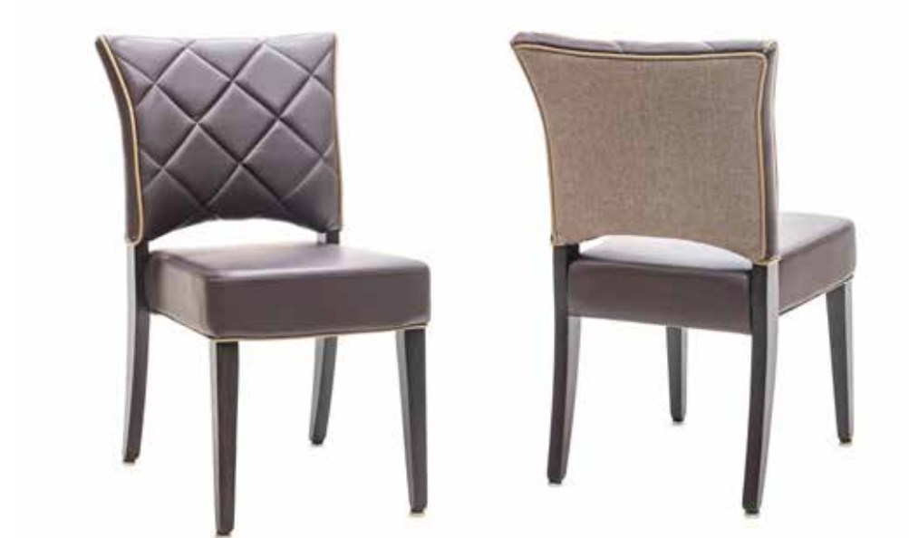
GLD-100 Shown with Optional Diamond Channel Sewing

FEATURED MODEL: GLD-100 Shown with Optional Diamond Channel Sewing