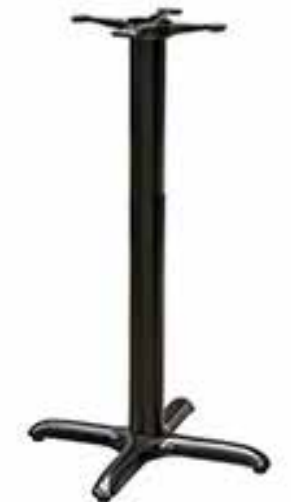
4 VANE BAR HEIGHT TABLE BASE