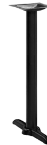
2 VANE BAR HEIGHT TABLE BASE