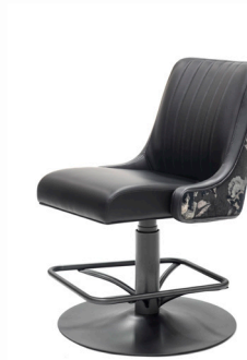
AVT-100-180-PASH SLOT STOOL

Approximate Dimensions: Seat Height: 24.0 in Seat Width: 18.5 in Seat Depth: 18.0 in Overall Height: 39.8 in Overall Width: 22.0 in Overall Depth: 24.5 in