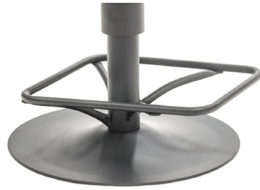
Shown with Optional Column Cover

Additional base designs and custom base options are available. All bases options may not fit all models.