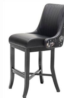
AVT-100-27SH TABLE GAMES STOOL

Approximate Dimensions: Seat Height: 24.0 in Seat Width: 18.5 in Seat Depth: 18.0 in Overall Height: 39.8 in Overall Width: 22.0 in Overall Depth: 24.5 in