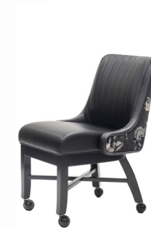
AVT-100-C TABLE GAMES CHAIR

Approximate Dimensions: Seat Height: 27.0 in Seat Width: 18.5 in Seat Depth: 18.0 in Overall Height: 42.8 in Overall Width: 22.0 in Overall Depth: 24.5 in